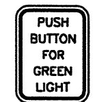
PEDESTRIAN CROSSING SIGN