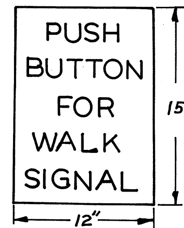
OHIO D.O.T. NO. R 73-12 (1 SIGN WITH EACH PEDESTRIAN PUSH BUTTON)