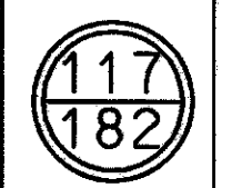
CROSS SECTION STA. 282+00 TO STA. 285+00 (WB) STA. 282+00 TO STA. 285+00 (EB)