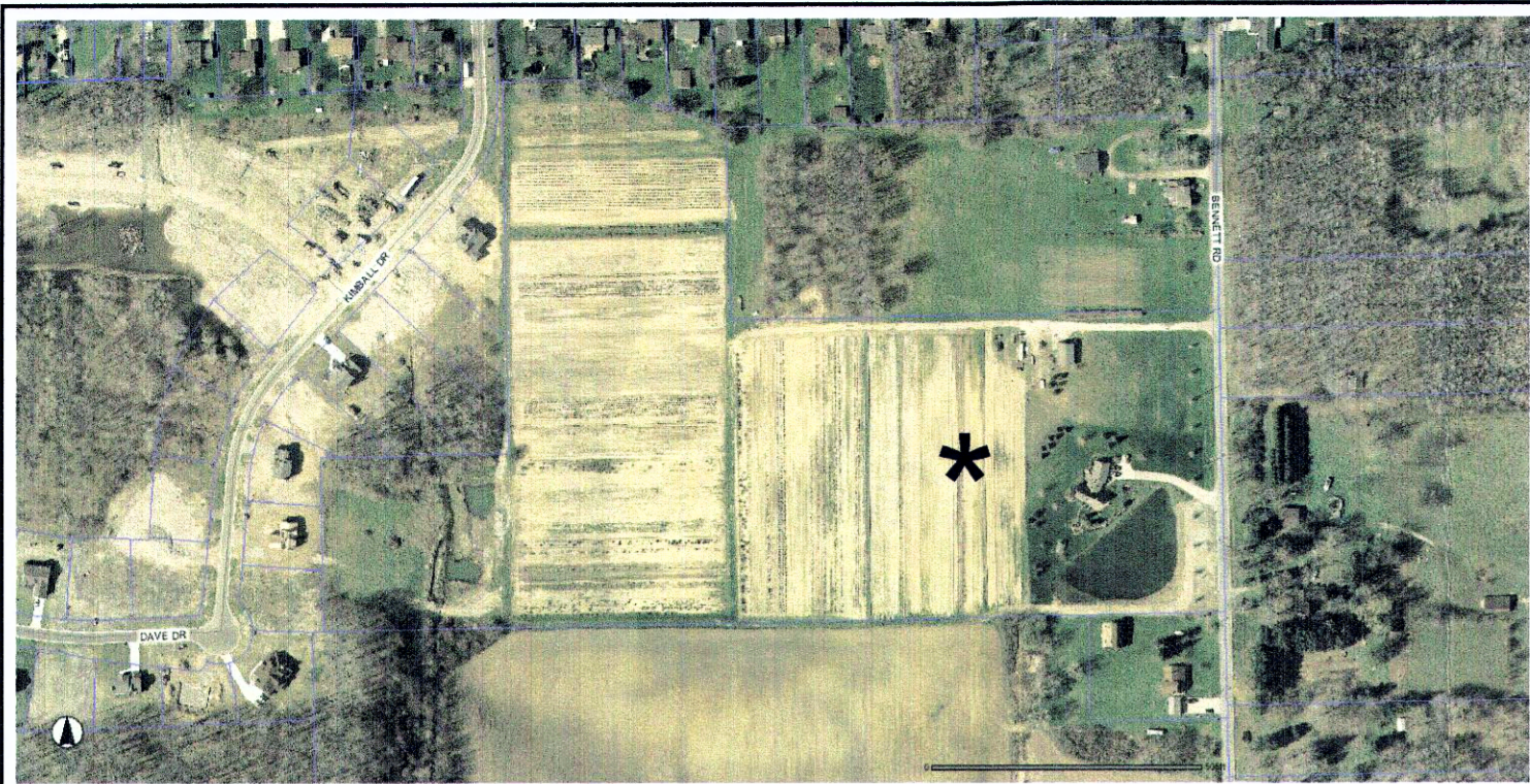
* PROPERTY LOCATION