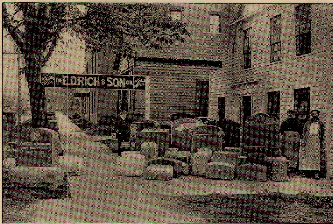
PARTIAL VIEW OF OUR PAINESVILLE PLANT.